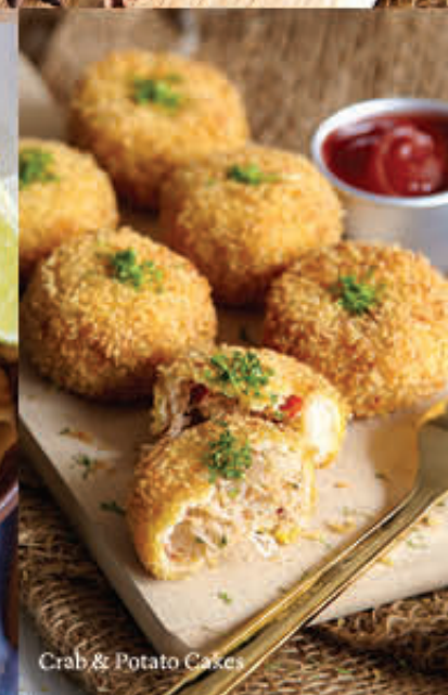
Crab & Potato Cakes