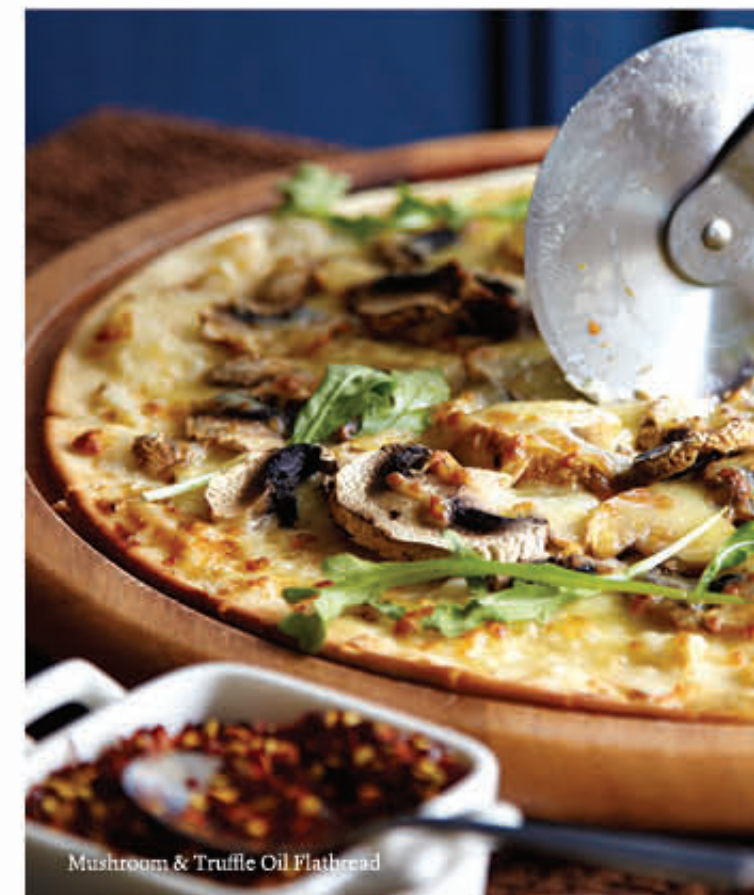
Mushroom & Truffle Oil Flatbread

A combination of the purest flavours: fresh tomatoes with mozzarella, basil and rocket leaves for a simple indulgence