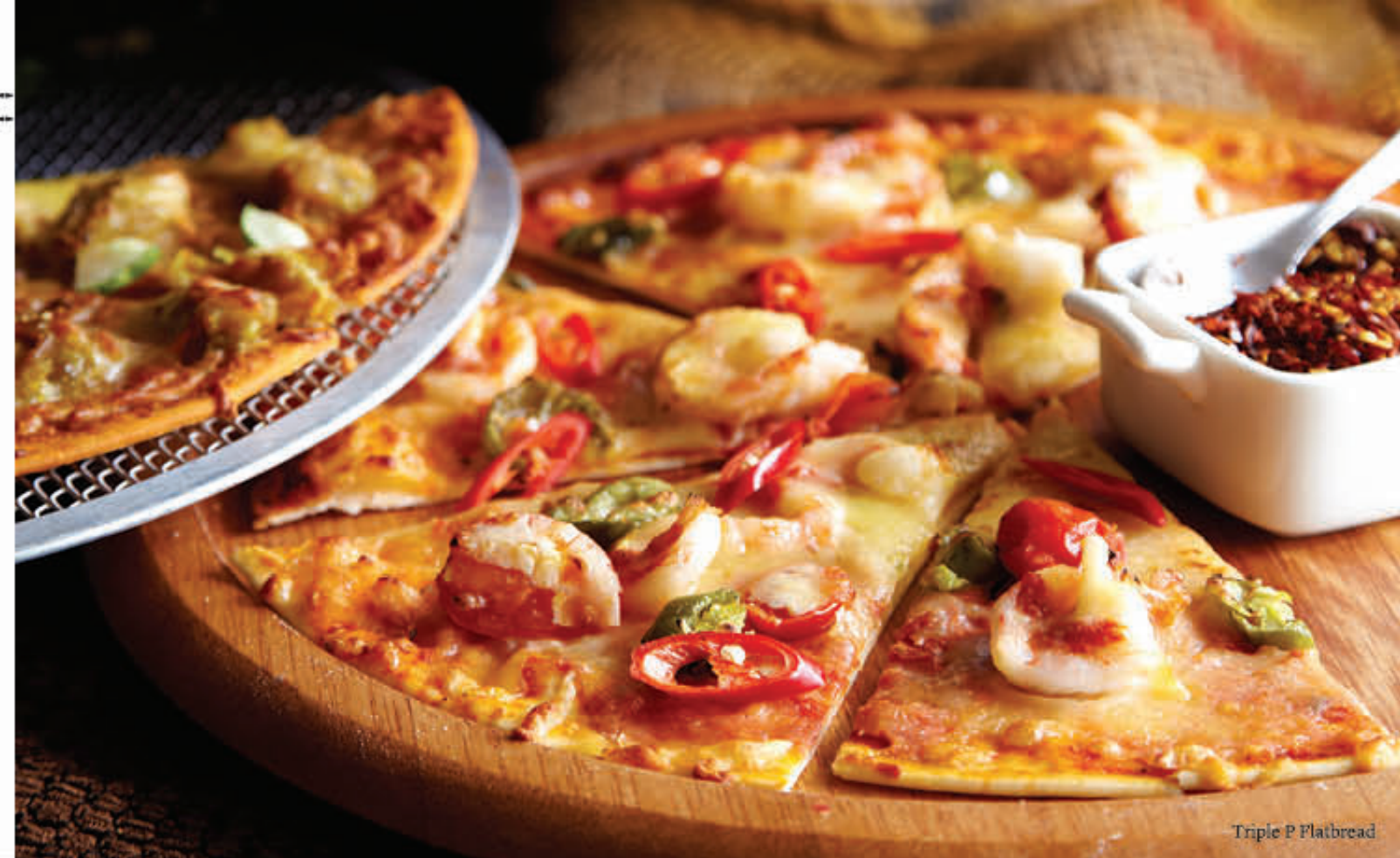
Triple P Flatbread