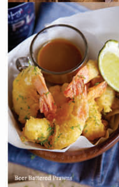
Beer Battered Prawns