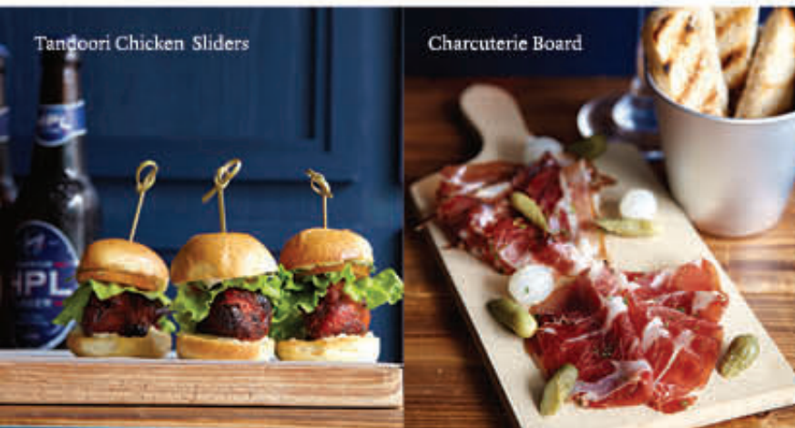
Tandoori Chicken Sliders