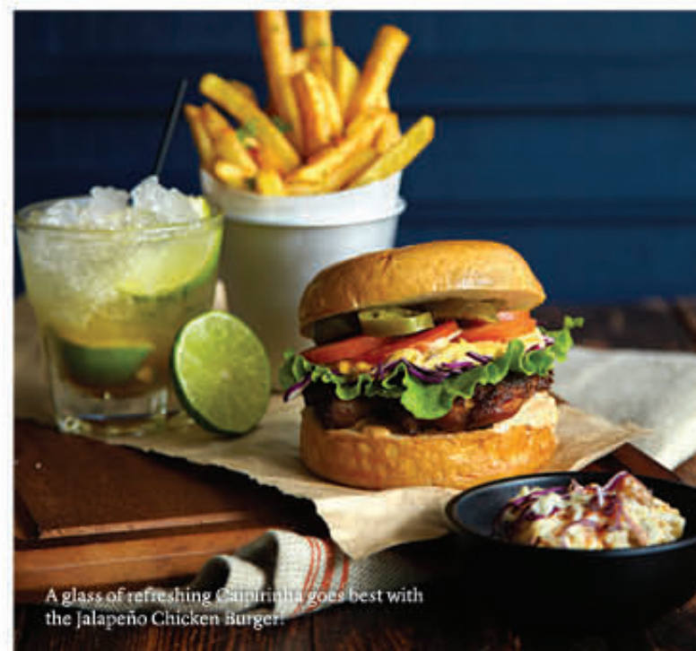
A glass of refreshing Capirotina goes best with the Jalapeño Chicken Burger.

Savour this classic with a refreshing twist. We dissolve cinnamon sugar cube in fine whisky before adding a splash of angostura bitters and orange slices